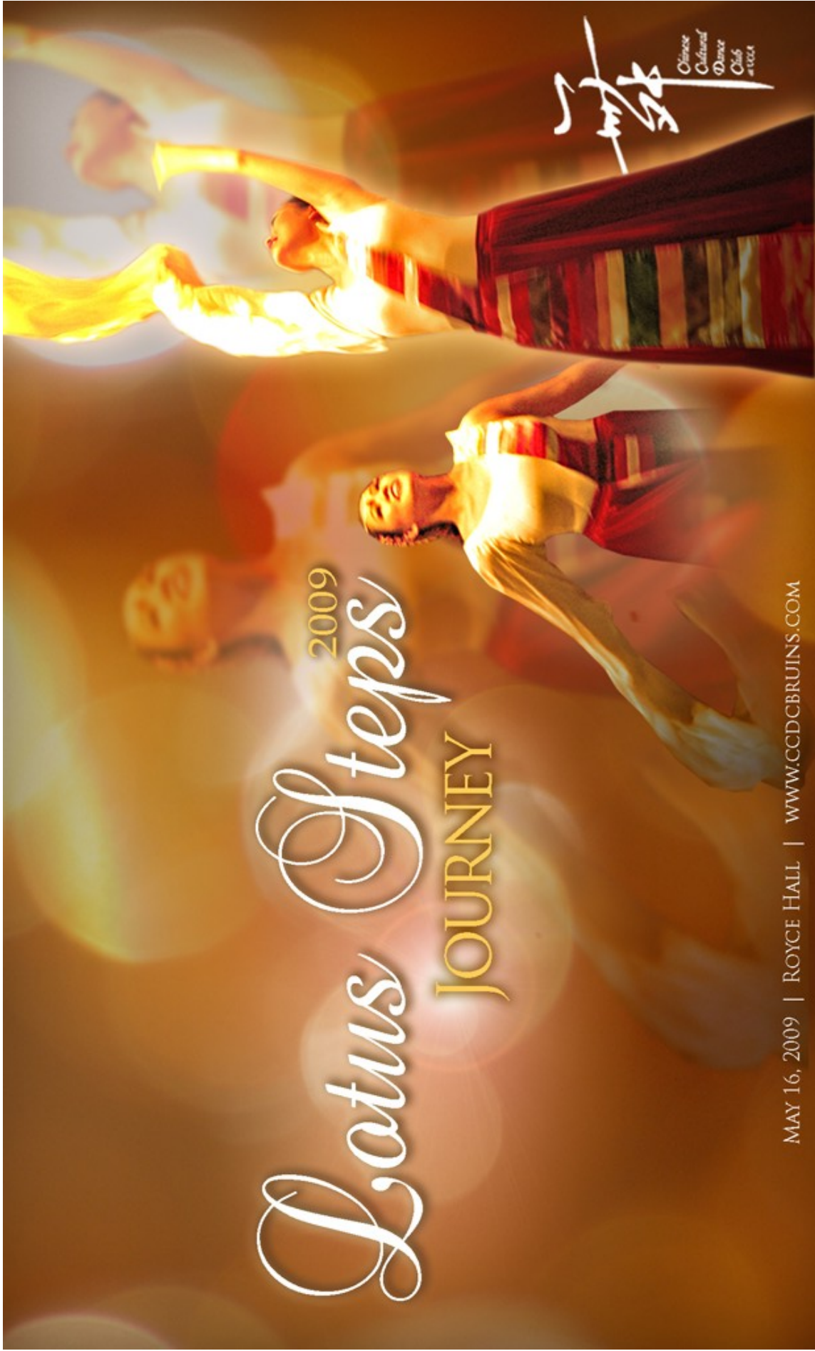
Promotional poster for "Lotus Steps 2009"